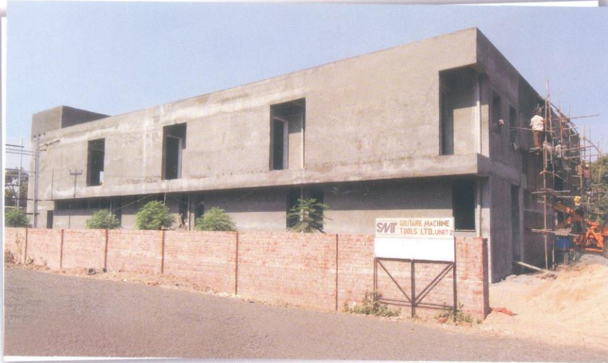
SMT - Plant II in final phase of construction.