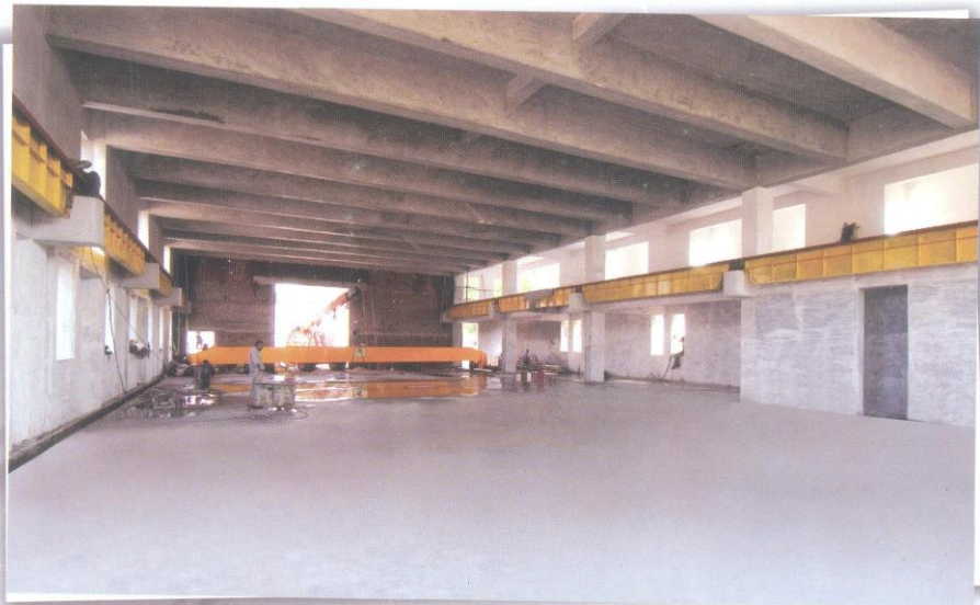
SMT - Plant II - Wide single bay with heavy crane.