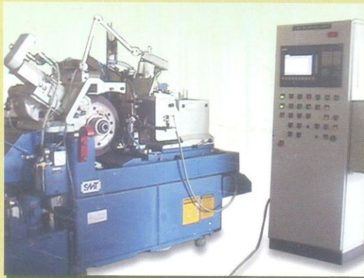
SMT #2 CNC Valve Groove Grinding M/C with feeder.