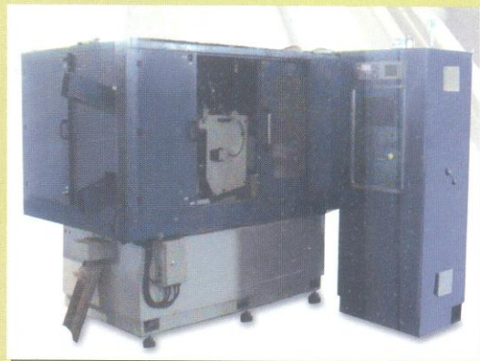
Rebuilt & Retrofitted FAMIR external race grinder.

IF YOU THINK OF CENTERLESS - THINK OF SOLITAIRE