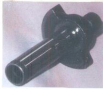
Crankshaft face and diameter ground in one setup