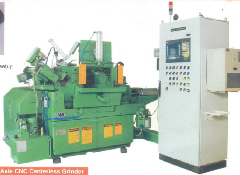
Solitaire No. 2- i 4 Axis CNC Centerless Grinder