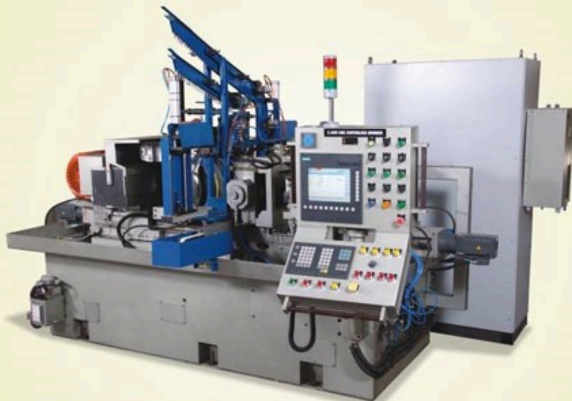
Guards and Covers removed for better view of the machine