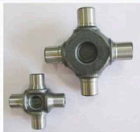
Universal Joint Cross